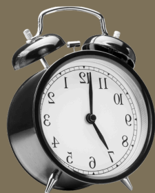
Exhibit Hall Open: Monday, June 24 from 3:00 pm - 6:00 pm Exhibitor Prize Drawings: Monday, June 24 at 5:30 pm Exhibitor Breakdown: Monday, June 24 at 6:00 pm

Exhibitor Check-in and Set up times will be provided with your event confirmation